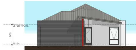
ELEVATION 1 1:100